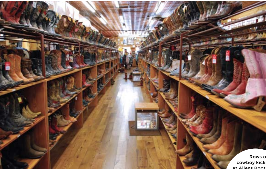
Rows of cowboy kicks at Allens Boots

Texas is peppered with custom boot makers who can mold leather into works of art. But many of these artisans have steep prices that make their wares inaccessible to the average cowgirl. Enter Heritage Boot. Owned by Dublin native Jerome Ryan, Heritage crafts handmade boots in a variety of exotic leathers at prices ranging from less than $300 to the low $2,000s, though most hover around $500 to $600. The designs, drawing inspiration from the 1930s through the '60s, are guaranteed conversation-starters. 1200 S. Congress Ave., 326-8577, heritageboot.com