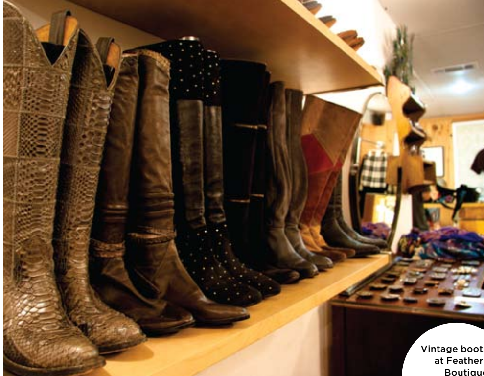
Vintage boots at Feathers Boutique

Wearing brand-new designer digs can cost a pretty penny, but Restyle provides an affordable alternative. This upscale women's consignment shop features trendy, high-end clothing and an amazing selection of purses, shoes and jewelry for a fraction