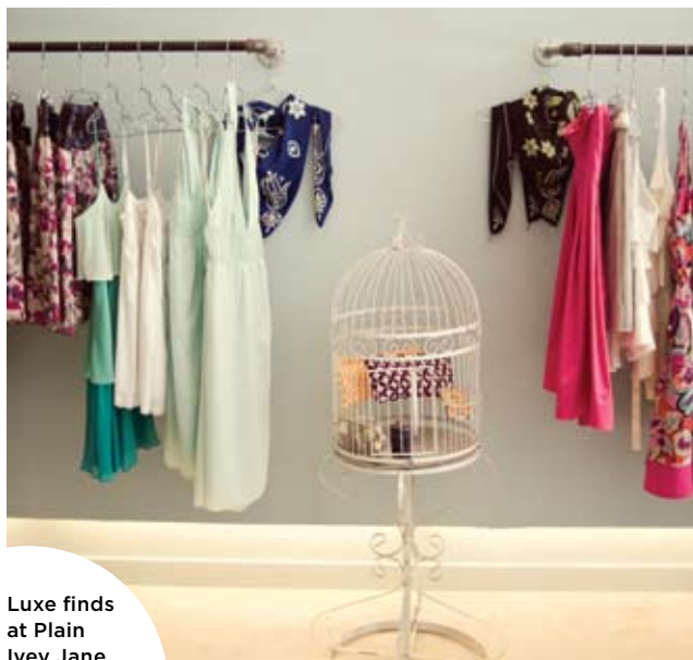
Luxe finds at Plain Ivey Jane

This posh spot is heaven for girls with luxury taste on a tight budget. Score great finds from Laundry, Badgley Mischka, Helmut Lang and more than 50 other high-end designers. The owner buys overstock from various brands and designers at a discount, which she passes down to the customer. Plain Ivey Jane also supports Austin's artistic community by carrying jewelry and baubles by local artisans. 408 W. Second St., 377-6196, plainiveyjane.com