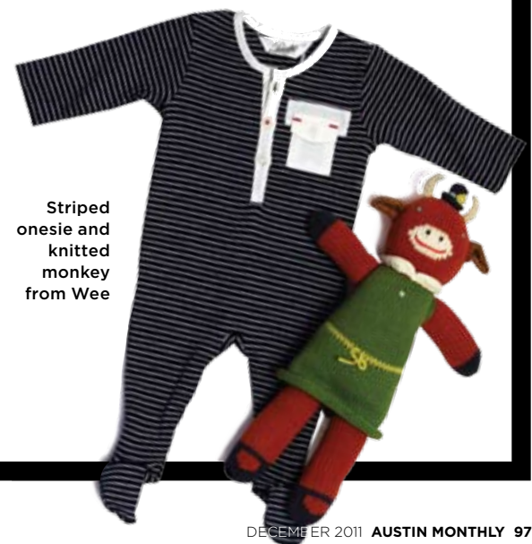
Striped onesie and knitted monkey from Wee

Baby Coco sells handcrafted furniture, custom and designer bedding and accessories, from hand-bound albums and heirloom quality blankets to stylish diaper bags. 1515-B W. 35th St., 377-2626, babycoco.com