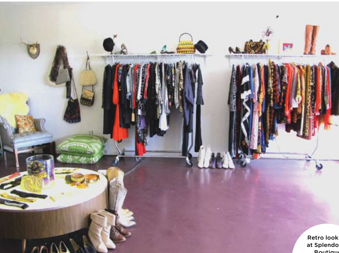
Retro looks at Splendor Boutique

Cream Vintage's Guadalupe-based storefront, a bright red pop of color against a blue graffiti-sided building, makes it look like something of an adult candy store. And arguably it is, with its