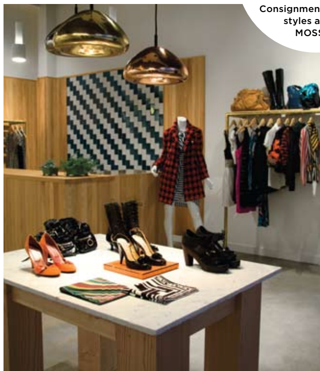
Consignment styles at MOSS

Trendy Dallasites on a budget have long frequented The Impeccable Pig, the University Park-born boutique that's filled with everything from graphic print dresses and trendy rompers to a litany of eclectic accessories. Best of all, The Impeccable Pig's helpful website lets you e-shop for all the goods when you can't swing a trip down SoCo on your lunch break. 1400 S. Congress Ave., 383-8833, theimpeccablepig.com