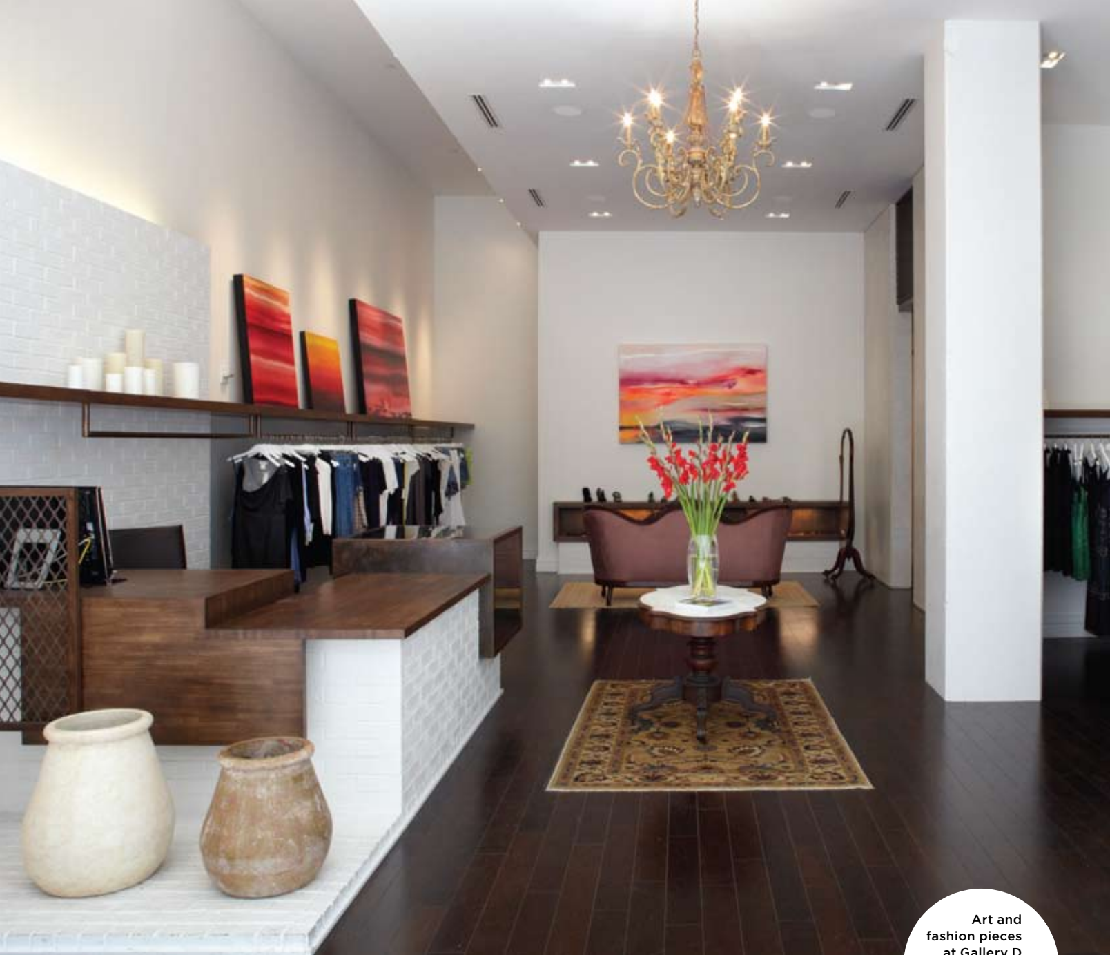
Art and fashion pieces at Gallery D