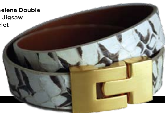
Leighelena Double Wrap Jigsaw bracelet