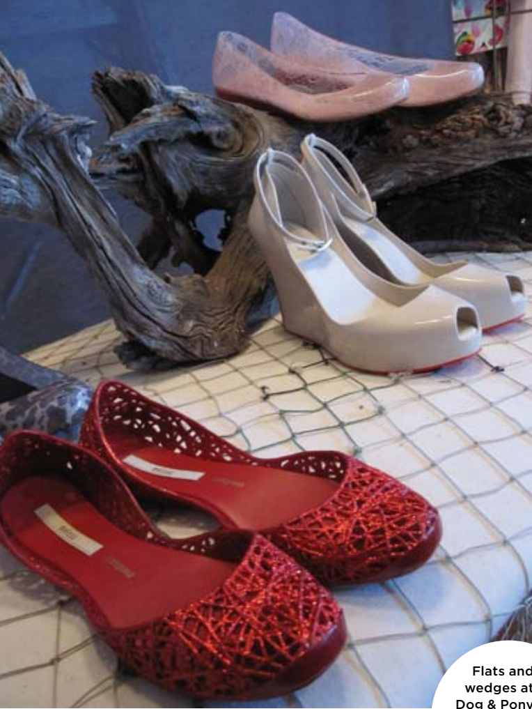
Flats and wedges at Dog & Pony